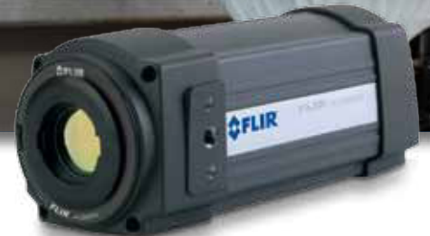
The FLIR A310 thermal imaging camera provides fully radiometric thermal footage at a resolution of 320 x 240 pixels.

As the milking is no longer done by hand in most modern dairy farms, the farmer does not feel the increased temperature of the udders that warns of developing Mastitis. "This is a big problem for the milking industry. Mastitis causes pain and general discomfort for the animal and it has to be treated with antibiotics. This not only leads to veterinary costs. Due to strict European rules the milk has to be discarded until all of the antibiotic drug residues have left the animal's system."