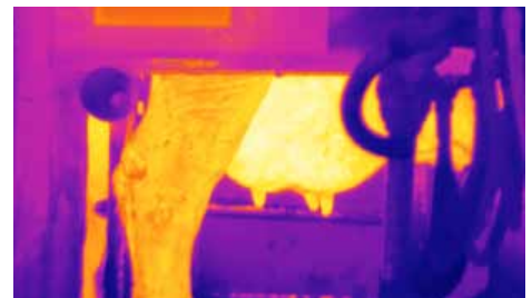
The two FLIR A310 thermal imaging cameras record images of the cow's udder from both sides.

Eieren agrees. "The product we currently market is CaDDi Mastitis, but in the future modules for other diseases and for other animals will be developed. We work closely with veterinarians from the Swedish National Veterinary Institute to verify the accuracy of all our present and future modules."