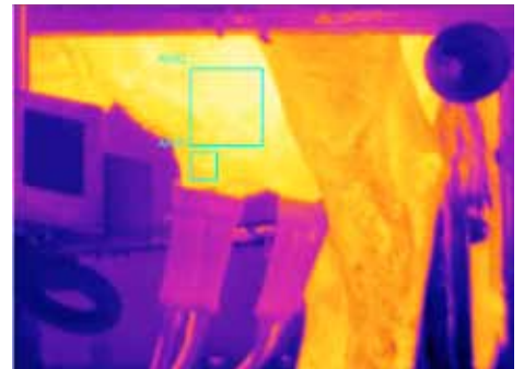
Automatic analysis software uses advanced algorithms to detect developing Mastitis in thermal images of cow udders.

Estimates vary, but it is certain that the total annual cost of Mastitis in dairy cows for European farmers runs in tens of millions. "I was shocked to find that the average dairy farmer is currently losing 20,000 to 60,000 Euros each year due to Mastitis. That is a large sum of money. We therefore set out to find a solution for this problem: an automatic early detection system based on thermal imaging technology."