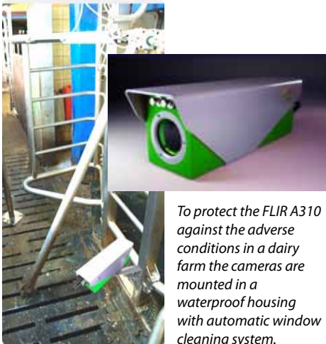
To protect the FLIR A310 against the adverse conditions in a dairy farm the cameras are mounted in a waterproof housing with automatic window cleaning system.