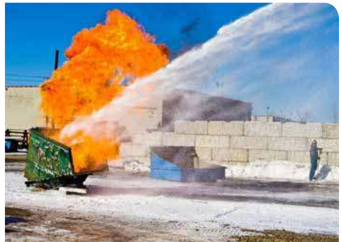
During a controlled demonstration of the Fire Rover's firefighting capabilities, the Watchdog Security team set fire to jet fuel in open metal bins. The FLIR A310f thermal camera instantly detected each fire, triggering a visual alarm (marked in red above). An operator using a laptop then aimed and released the Fire Rover's fire-fighting foam, extinguishing the fires in seconds.

the A310f ignores visible light, it works equally well day or night.