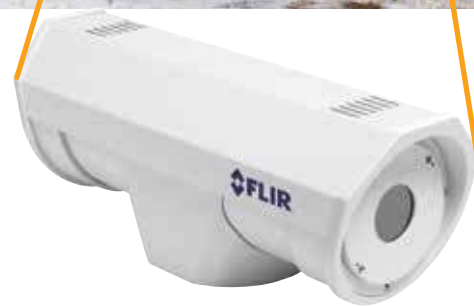
FLIR A310f thermal imaging camera.

The A310f has extensive alarm functions and can automatically send analysis results, IR images and additional data as an e-mail using Modbus TCP/IP or Ethernet IP. The A310f has a fixed 25° lens and outputs both PAL and NTSC composite video. And because