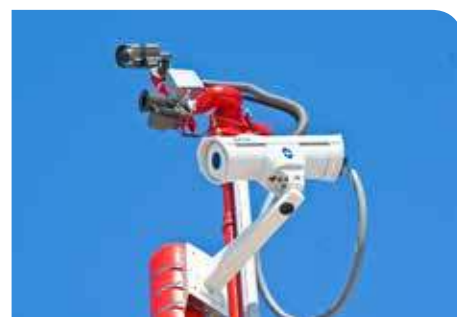
The FLIR A310f is the essential component of the Fire Rover system.