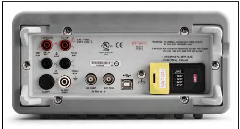
Model 2100 rear panel

AC CMRR: 70dB (for 1kΩ unbalance LO lead). POWER SUPPLY: 120V/220V/240V. POWER LINE FREQUENCY: 50/60Hz auto detected. POWER CONSUMPTION: 25VA max. DIGITAL I/O INTERFACE: USB-compatible Type B connection. ENVIRONMENT: For indoor use only. OPERATING TEMPERATURE: 5° to 40°C. OPERATING HUMIDITY: Maximum relative humidity 80% for temperature up to 31°C, decreasing linearly to 50% relative humidity at 40°C. STORAGE TEMPERATURE: –25° to 65°C. OPERATING ALTITUDE: Up to 2000m above sea level. BENCH DIMENSIONS (with handles and feet): 112mm high × 256mm wide × 375mm deep (4.4 in. × 10.1 in. × 14.75 in.). WEIGHT: 4.1kg (9 lbs.). SAFETY: Conforms to European Union Directive 73/23/ECC, EN61010-1, UL61010-1:2004. EMC: Conforms to European Union Directive 89/336/EEC, EN61326-1. WARRANTY: One year.